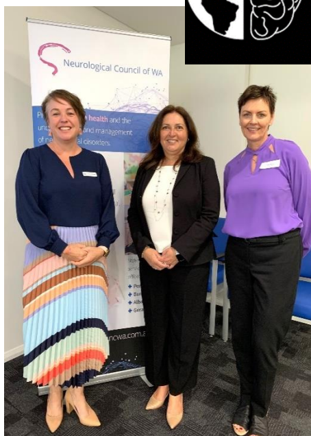
Community Neurological Leaders Forum