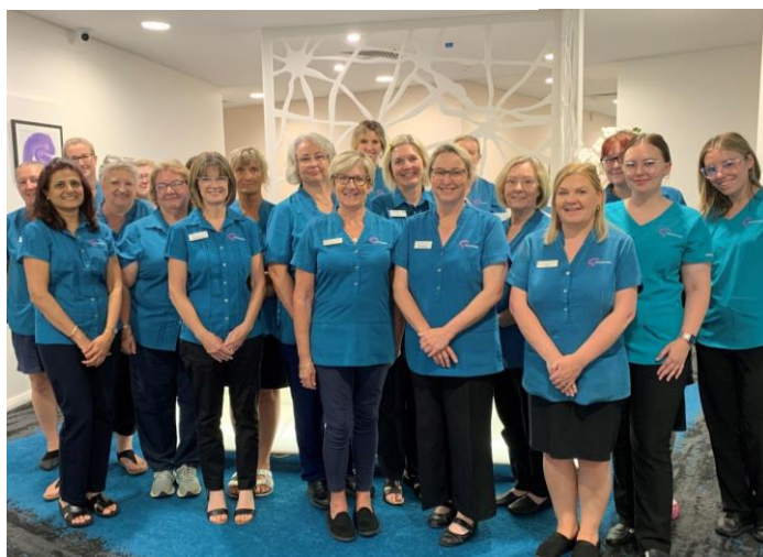
Neurocare WA Community Neurological Nursing Team